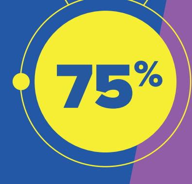
75% don't find it useful.