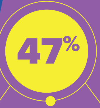
However, 47% follow brands in social media...