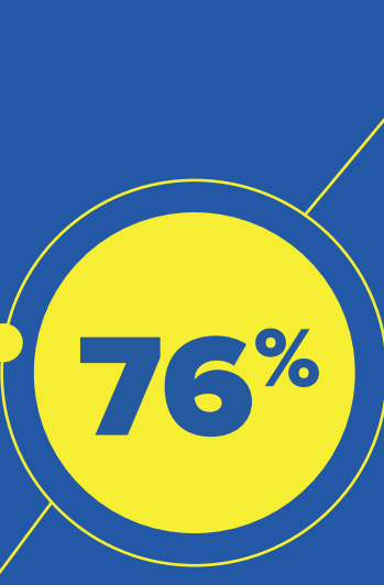
76% claim never to have purchased anything in their feed.

The Social Commerce advertising model is missing a trick by not distinguishing between Customers and Prospects.