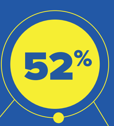
52* of respondents dislike advertising in their feed,