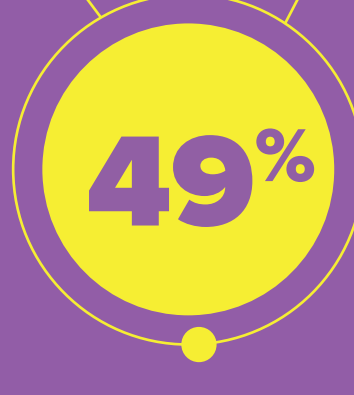
...and 49% claim to have purchased a product as a result of recommendations seen in a Brand's social feed.